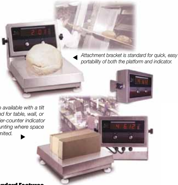
Attachment bracket is standard for quick, easy portability of both the platform and indicator.

All operations are controlled through two buttons—zero and units. Push-button zero and a full range of units, including lb/oz, offer the flexibility needed for a wide variety of applications.