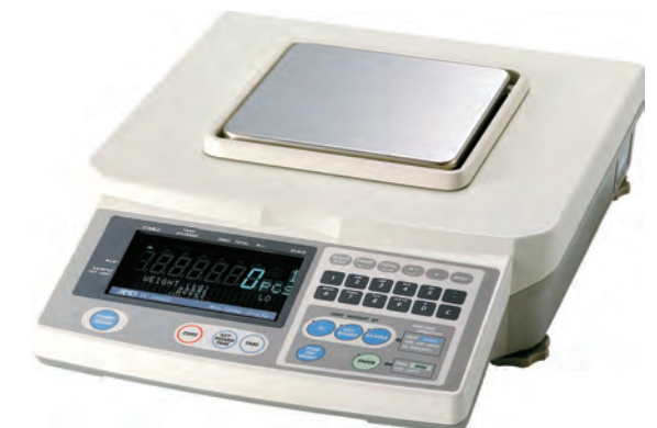
FC-Si 5,000,000 parts Internal Resolution