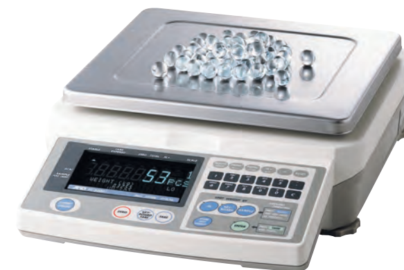
FC-i 1,000,000 parts Internal Resolution