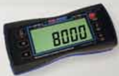
MSI-8000 RF Remote Display