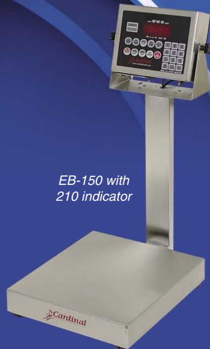
EB-150 with 210 indicator

Whatever your needs may be, select from Cardinal's complete line of stainless steel bench scales.