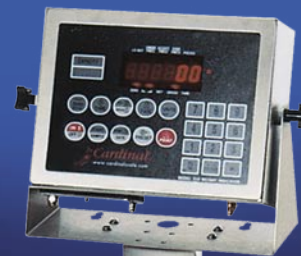
EB-300 with 210 Indicator