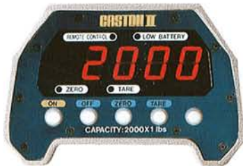
▲ Display & Keyboard