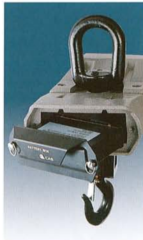
▶ Battery Pack Installation